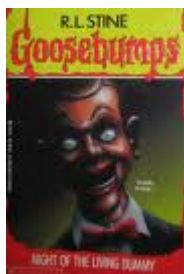
Book:8-Night Of The Living Dummy