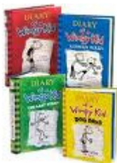
Book:6-Diary Of A Wimpy Kid